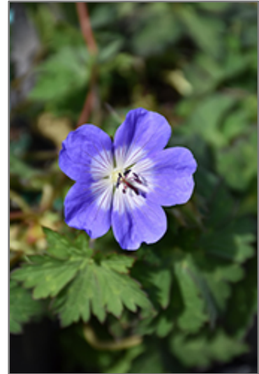
Azure Rush Cranesbill flowers

Azure Rush Cranesbill is recommended for the following landscape applications;