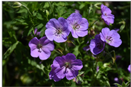
Azure Rush Cranesbill flowers