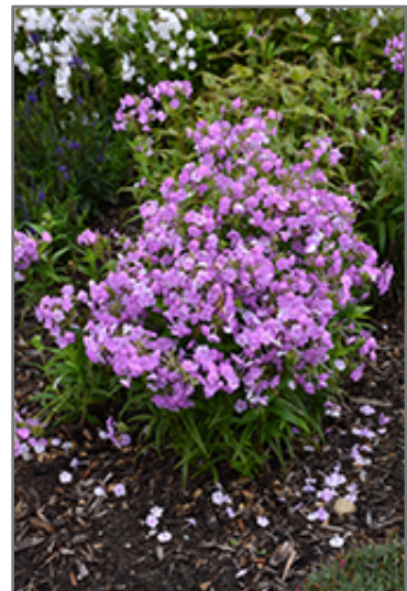
Fashionably Early Princess Garden Phlox in bloom