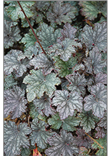
Frosted Violet Coral Bells foliage

Frosted Violet Coral Bells is recommended for the following landscape applications;