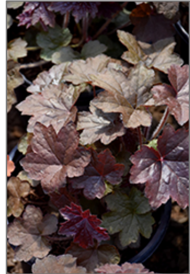
Palace Purple Coral Bells foliage

Palace Purple Coral Bells is recommended for the following landscape applications;