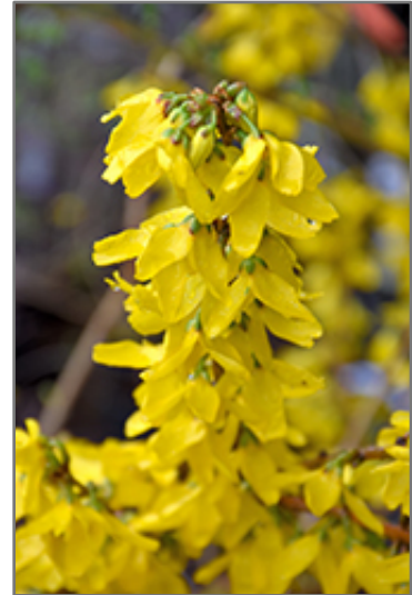
Magical Gold Forsythia flowers

Magical Gold Forsythia makes a fine choice for the outdoor landscape, but it is also well-suited for use in outdoor pots and containers. Because of its height, it is often used as a 'thriller' in the 'spiller-thriller-filler' container combination; plant it near the center of the pot, surrounded by smaller plants and those that spill over the edges. It is even sizeable enough that it can be grown alone in a suitable container. Note that when grown in a container, it may not perform exactly as indicated on the tag - this is to be expected. Also note that when growing plants in outdoor containers and baskets, they may require more frequent waterings than they would in the yard or garden.