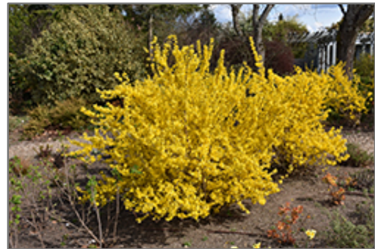
Magical Gold Forsythia in bloom