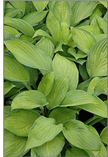
Gold Standard Hosta foliage