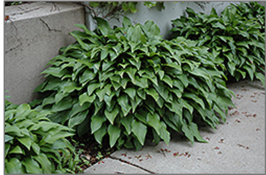
Invincible Hosta

Invincible Hosta is recommended for the following landscape applications;