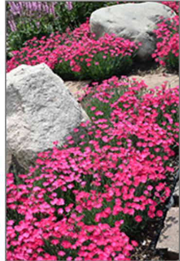
Paint The Town Magenta Pinks in bloom

Paint The Town Magenta Pinks is an herbaceous evergreen perennial with a mounded form. It brings an extremely fine and delicate texture to the garden composition and should be used to full effect.