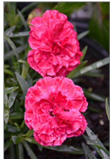
Fruit Punch Raspberry Ruffles Pinks flowers