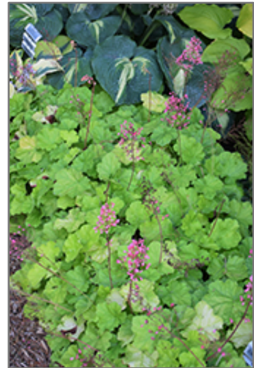
Primo Pretty Pistachio Coral Bells in bloom

This is a relatively low maintenance plant, and should be cut back in late fall in preparation for winter. It is a good choice for attracting butterflies and hummingbirds to your yard. It has no significant negative characteristics.