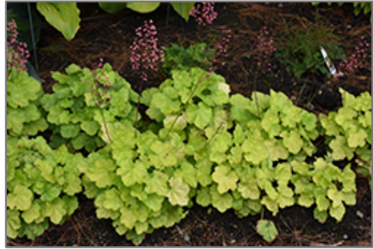
Primo Pretty Pistachio Coral Bells

Primo Pretty Pistachio Coral Bells is a fine choice for the garden, but it is also a good selection for planting in outdoor pots and containers. With its upright habit of growth, it is best suited for use as a 'thriller' in the 'spiller-thriller-filler' container combination; plant it near the center of the pot, surrounded by smaller plants and those that spill over the edges. Note that when growing plants in outdoor containers and baskets, they may require more frequent waterings than they would in the yard or garden.