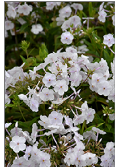
Fashionably Early Crystal Garden Phlox flowers