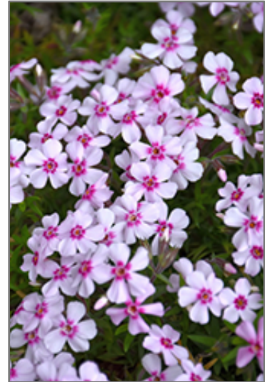
Coral Eye Moss Phlox flowers

Coral Eye Moss Phlox is a fine choice for the garden, but it is also a good selection for planting in outdoor pots and containers. Because of its spreading habit of growth, it is ideally suited for use as a 'spiller' in the 'spiller-thriller-filler' container combination; plant it near the edges where it can spill gracefully over the pot. Note that when growing plants in outdoor containers and baskets, they may require more frequent waterings than they would in the yard or garden.