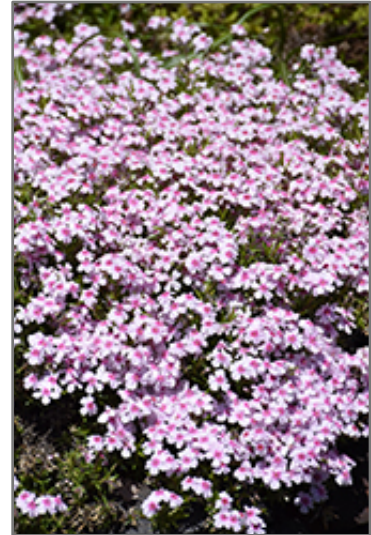
Coral Eye Moss Phlox flowers