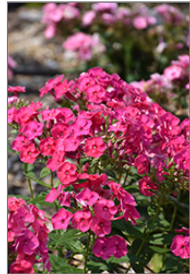
Ka-Pow Pink Garden Phlox flowers

Ka-Pow Pink Garden Phlox is recommended for the following landscape applications;