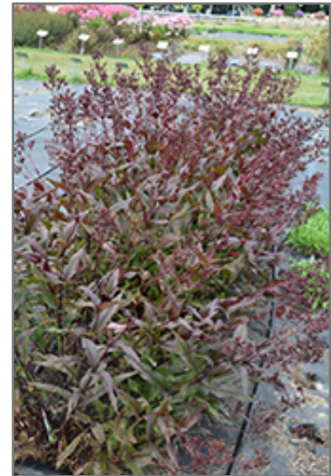
Pocahontas Beard Tongue

This is a relatively low maintenance plant, and is best cleaned up in early spring before it resumes active growth for the season. It is a good choice for attracting butterflies to your yard. It has no significant negative characteristics.