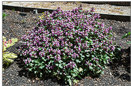
Beacon Silver Spotted Dead Nettle in bloom