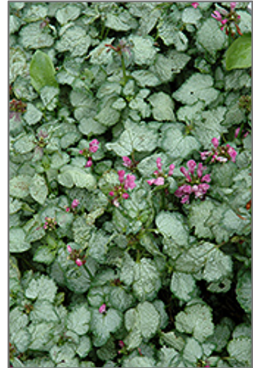
Beacon Silver Spotted Dead Nettle flowers