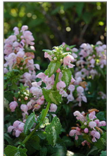
Shell Pink Spotted Dead Nettle flowers