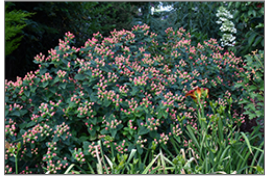
FloralBerry Rosé St. John's Wort fruit

FloralBerry Rosé St. John's Wort will grow to be about 3 feet tall at maturity, with a spread of 3 feet. It tends to fill out right to the ground and therefore doesn't necessarily require facer plants in front. It grows at a medium rate, and under ideal conditions can be expected to live for approximately 5 years. This is a self-pollinating variety, so it doesn't require a second plant nearby to set fruit.