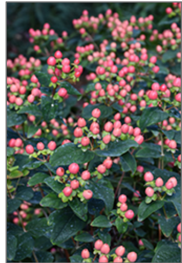
FloralBerry Rosé St. John's Wort fruit

FloralBerry Rosé St. John's Wort is recommended for the following landscape applications;