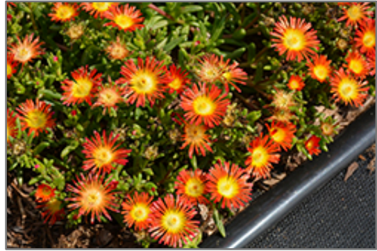
Delmara Red Ice Plant flowers

Delmara Red Ice Plant is a fine choice for the garden, but it is also a good selection for planting in outdoor pots and containers. Because of its spreading habit of growth, it is ideally suited for use as a 'spiller' in the 'spiller-thriller-filler' container combination; plant it near the edges where it can spill gracefully over the pot. Note that when growing plants in outdoor containers and baskets, they may require more frequent waterings than they would in the yard or garden.