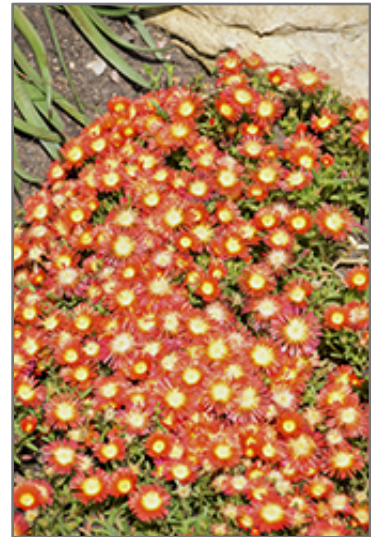
Delmara Red Ice Plant

This is a relatively low maintenance plant, and is best cleaned up in early spring before it resumes active growth for the season. It is a good choice for attracting bees and butterflies to your yard. It has no significant negative characteristics.