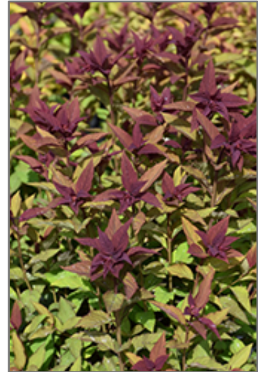
Double Play Doozie Spirea foliage

This shrub should only be grown in full sunlight. It prefers to grow in average to moist conditions, and shouldn't be allowed to dry out. It is not particular as to soil type or pH. It is highly tolerant of urban pollution and will even thrive in inner city environments. This particular variety is an interspecific hybrid.