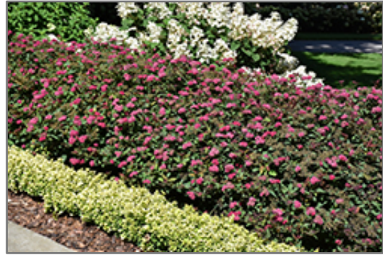
Double Play Doozie Spirea in bloom

This shrub will require occasional maintenance and upkeep, and is best pruned in late winter once the threat of extreme cold has passed. It is a good choice for attracting butterflies to your yard, but is not particularly attractive to deer who tend to leave it alone in favor of tastier treats. It has no significant negative characteristics.