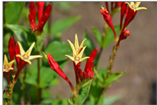
Little Redhead Indian Pink flowers