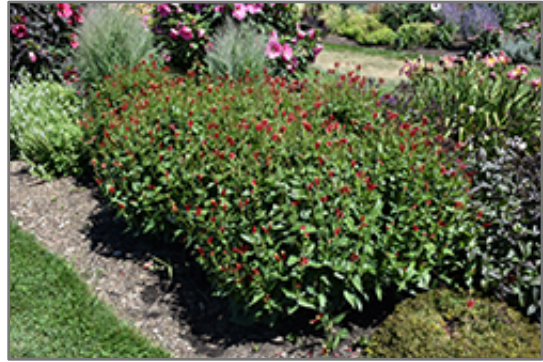
Little Redhead Indian Pink in bloom

Little Redhead Indian Pink will grow to be about 20 inches tall at maturity, with a spread of 24 inches. When grown in masses or used as a bedding plant, individual plants should be spaced approximately 20 inches apart. Its foliage tends to remain dense right to the ground, not requiring facer plants in front. It grows at a fast rate, and under ideal conditions can be expected to live for approximately 5 years. As an herbaceous perennial, this plant will usually die back to the crown each winter, and will regrow from the base each spring. Be careful not to disturb the crown in late winter when it may not be readily seen!