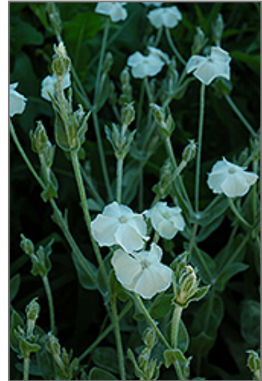
White Rose Campion flowers