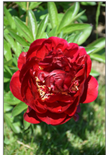
Buckeye Belle Peony flowers