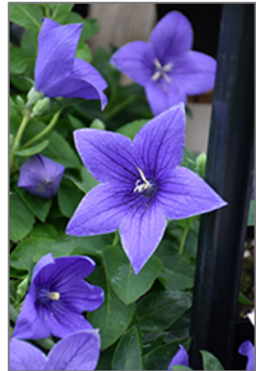
Pop Star Blue Balloon Flower flowers

Pop Star Blue Balloon Flower is recommended for the following landscape applications;