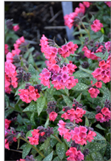
Shrimps On The Barbie Lungwort flowers

Shrimps On The Barbie Lungwort is recommended for the following landscape applications;