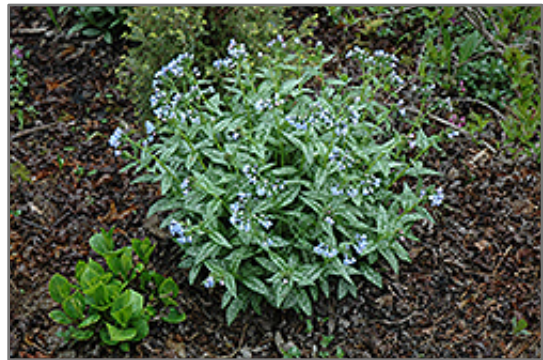
Roy Davidson Lungwort in bloom