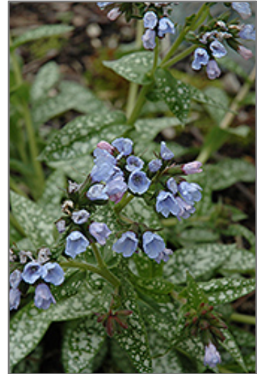
Roy Davidson Lungwort flowers