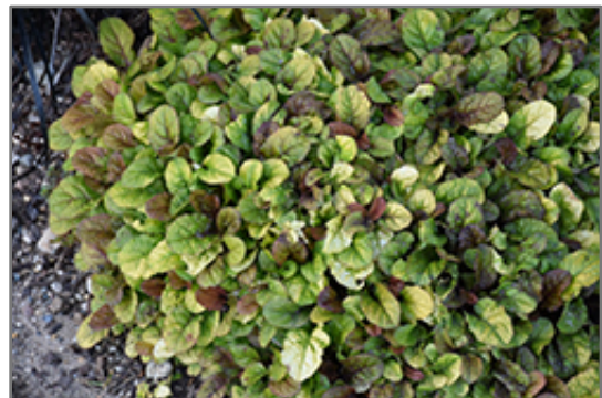
Feathered Friends Parrot Paradise Bugleweed