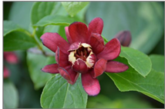
Simply Scentsational Sweetshrub flowers

Simply Scentsational Sweetshrub is recommended for the following landscape applications;