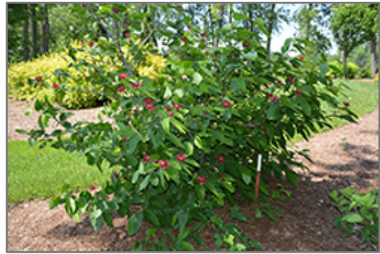
Simply Scentsational Sweetshrub in bloom

This shrub does best in full sun to partial shade. It is very adaptable to both dry and moist locations, and should do just fine under average home landscape conditions. It is not particular as to soil type or pH. It is somewhat tolerant of urban pollution. This is a selection of a native North American species.