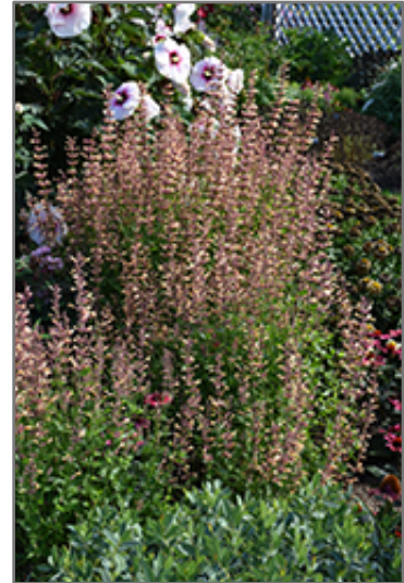
Meant To Bee Queen Nectarine Anise Hyssop in bloom

Meant To Bee Queen Nectarine Anise Hyssop is a fine choice for the garden, but it is also a good selection for planting in outdoor pots and containers. With its upright habit of growth, it is best suited for use as a 'thriller' in the 'spiller-thriller-filler' container combination; plant it near the center of the pot, surrounded by smaller plants and those that spill over the edges. It is even sizeable enough that it can be grown alone in a suitable container. Note that when growing plants in outdoor containers and baskets, they may require more frequent waterings than they would in the yard or garden.