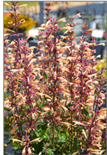
Meant To Bee Queen Nectarine Anise Hyssop flowers

Meant To Bee Queen Nectarine Anise Hyssop is recommended for the following landscape applications;