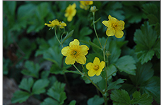
Barren Strawberry flowers