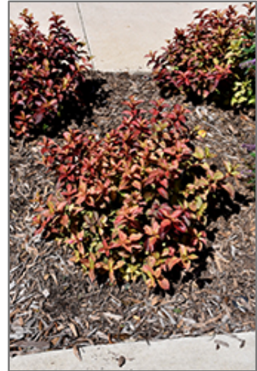
Midnight Sun Reblooming Weigela