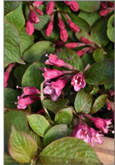
Midnight Sun Reblooming Weigela flowers

Midnight Sun Reblooming Weigela makes a fine choice for the outdoor landscape, but it is also well-suited for use in outdoor pots and containers. It is often used as a 'filler' in the 'spiller-thriller-filler' container combination, providing a mass of flowers and foliage against which the thriller plants stand out. Note that when grown in a container, it may not perform exactly as indicated on the tag - this is to be expected. Also note that when growing plants in outdoor containers and baskets, they may require more frequent waterings than they would in the yard or garden.