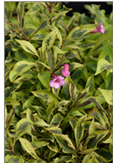
Bubbly Wine Weigela flowers