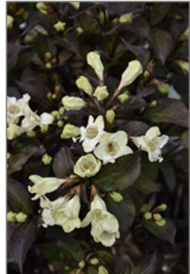
Wine & Spirits Weigela flowers