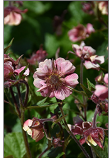
Tempo Rose Avens flowers

Tempo Rose Avens is recommended for the following landscape applications;