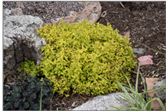
Lil' Sizzle Spirea

Lil' Sizzle Spirea is recommended for the following landscape applications;