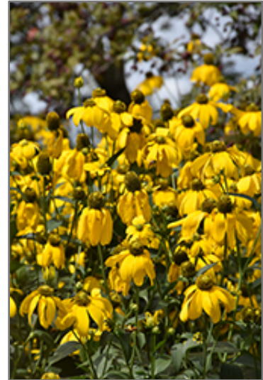
Cutleaf Coneflower flowers

Cutleaf Coneflower is recommended for the following landscape applications;