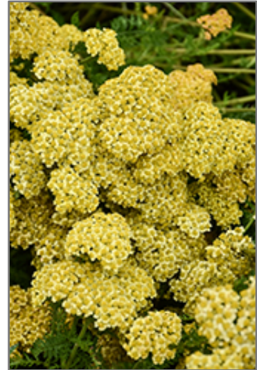
Milly Rock Yellow Terracotta Yarrow flowers