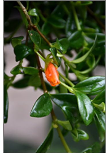
Goldfish Plant flowers

This is a dense herbaceous evergreen houseplant with a trailing habit of growth, eventually spilling over the edges of hanging baskets and containers. This plant can be pruned at any time to keep it looking its best.