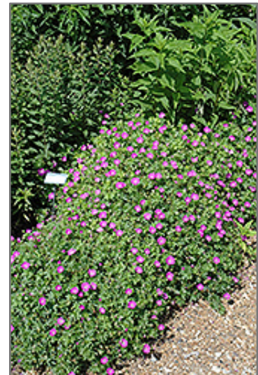
Max Frei Cranesbill in bloom