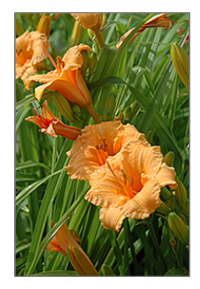
Bertie Ferris Daylily flowers

CustomerCare@WestonNurseries.com 93 East Main Street Hopkinton MA 02148 - (508) 435-3414 160 Pine Hill Road Chelmsford MA 01824 - (978) 349-0055 COMMERCIAL: commsales@westonnurseries.com - (508) 293-8028