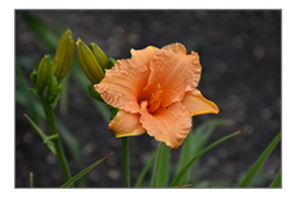
Bertie Ferris Daylily flowers

Bertie Ferris Daylily is recommended for the following landscape applications;