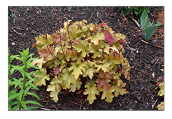
Marmalade Coral Bells