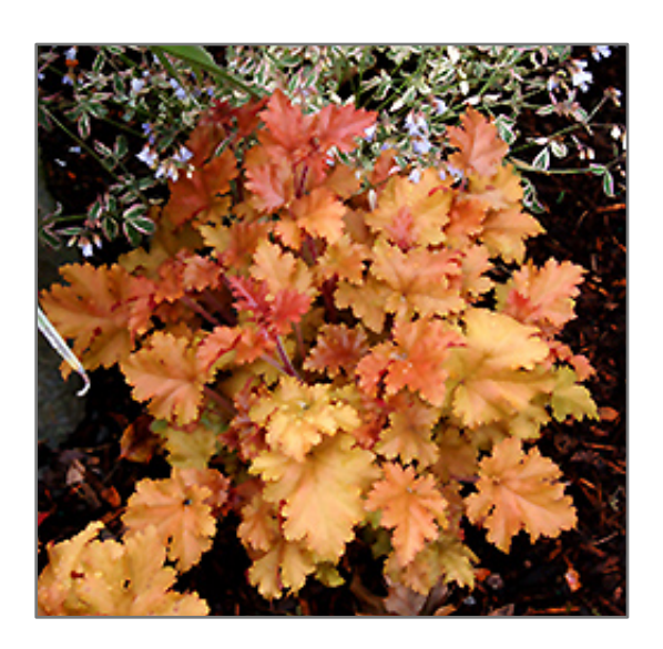
Marmalade Coral Bells foliage

Marmalade Coral Bells will grow to be about 8 inches tall at maturity extending to 18 inches tall with the flowers, with a spread of 16 inches. When grown in masses or used as a bedding plant, individual plants should be spaced approximately 14 inches apart. Its foliage tends to remain low and dense right to the ground. It grows at a medium rate, and under ideal conditions can be expected to live for approximately 10 years. As an evegreen perennial, this plant will typically keep its form and foliage year-round.