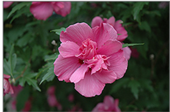
Lucy Rose Of Sharon flowers

Lucy Rose Of Sharon is recommended for the following landscape applications;