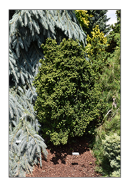
Dwarf Pagoda Japanese Holly

This is a relatively low maintenance shrub, and usually looks its best without pruning, although it will tolerate pruning. It is a good choice for attracting birds to your yard. It has no significant negative characteristics.