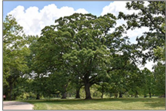
White Oak