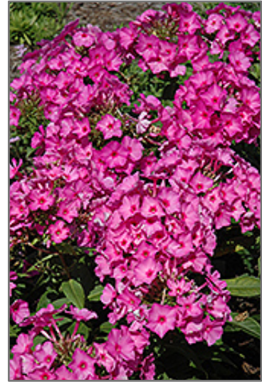
Pink Flame Garden Phlox flowers