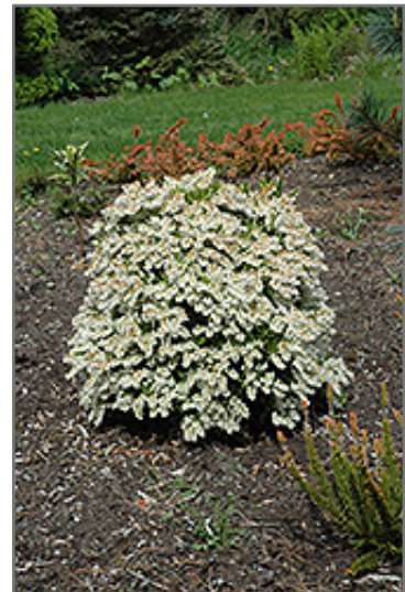
Prelude Japanese Pieris in bloom