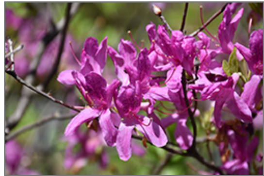
Lilac Lights Azalea flowers