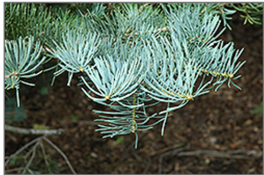
White Fir foliage