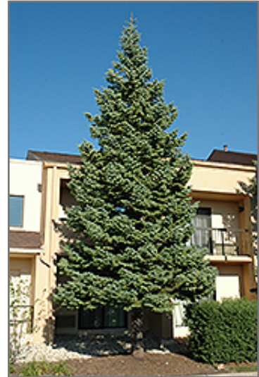
White Fir