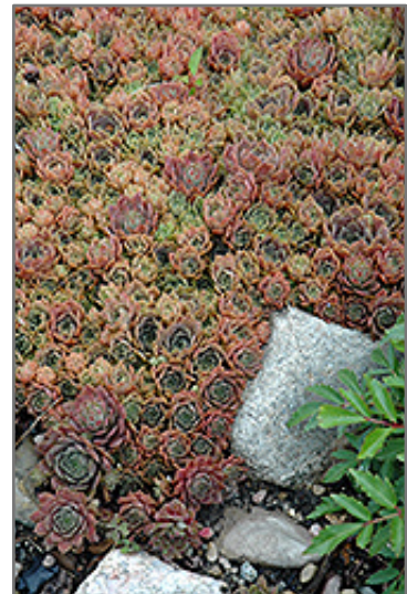
Silverine Hens And Chicks