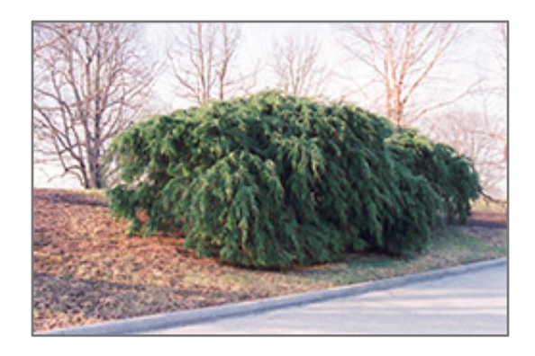
Sargent's Weeping Hemlock