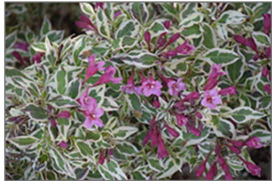
My Monet Weigela flowers

My Monet Weigela is recommended for the following landscape applications;